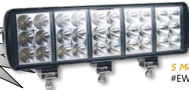
5 Module (4000 lm) #EWLS4000TBDF0W