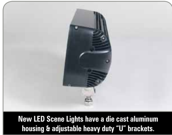
New LED Scene Lights have a die cast aluminum housing & adjustable heavy duty "U" brackets.